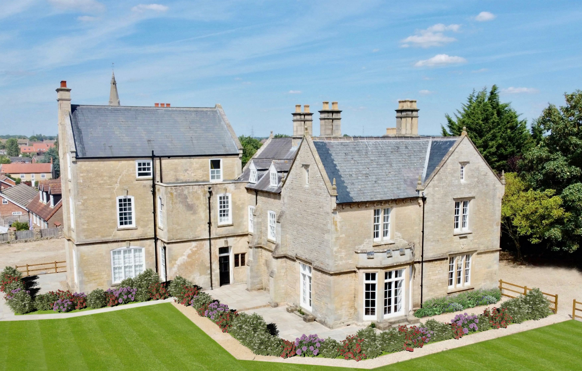
Leasingham Hall Sleaford